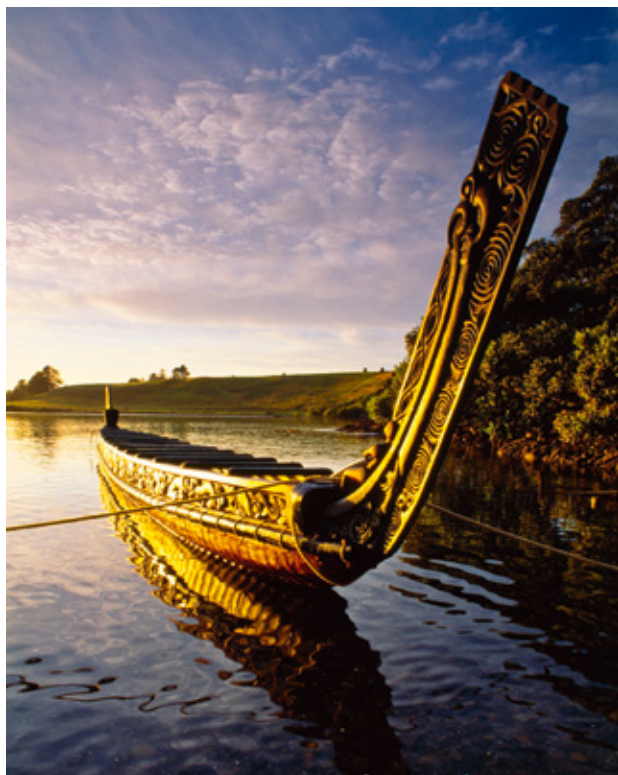
A waka (Maori war canoe) waits for its crew at Wairoa Bay, Waitangi.