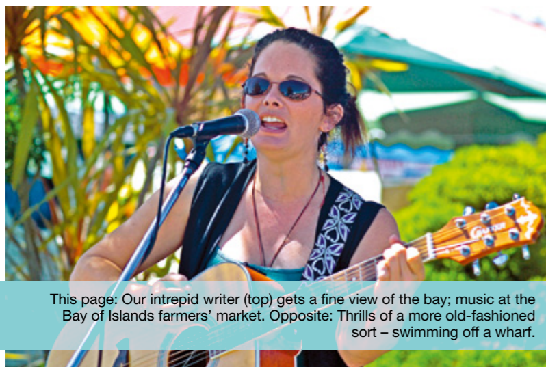
This page: Our intrepid writer (top) gets a fine view of the bay; music at the Bay of Islands farmers’ market. Opposite: Thrills of a more old-fashioned sort – swimming off a wharf.

“Parasailing is adrenalin sport ‘lite’ – no skills are required and the ride can be taken by anyone. Yet the rush is fantastic and you couldn’t find better views.”