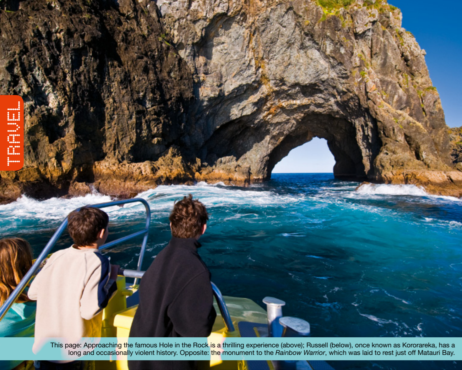
This page: Approaching the famous Hole in the Rock is a thrilling experience (above); Russell (below), once known as Kororareka, has a long and occasionally violent history. Opposite: the monument to the Rainbow Warrior , which was laid to rest just off Matakauri Bay.